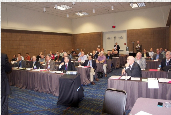
Forensic Short Course Attendees

Thank you to everyone who participated in the very successful short course, The Art & Science of Forensic Meteorology which was held at the Annual Meeting this past January in New Orleans. The course was sponsored by the CCM Board, the AMS and the National Council of Industrial Meteorologists. We had 30 participants and it has been suggested that we provide a similar short course in 2-3 years from now.