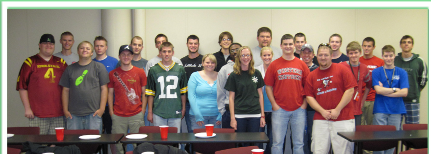
Western Kentucky University Student Chapter of the American Meteorological Society