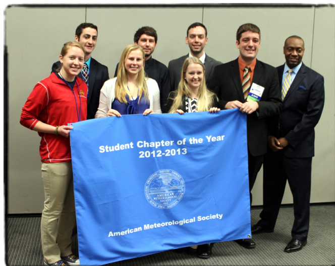
Iowa State University Student Chapter of the Year, 2012-2013