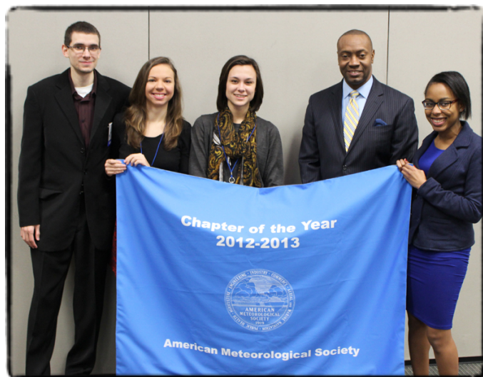
North Florida Chapter of the Year, 2012-2013