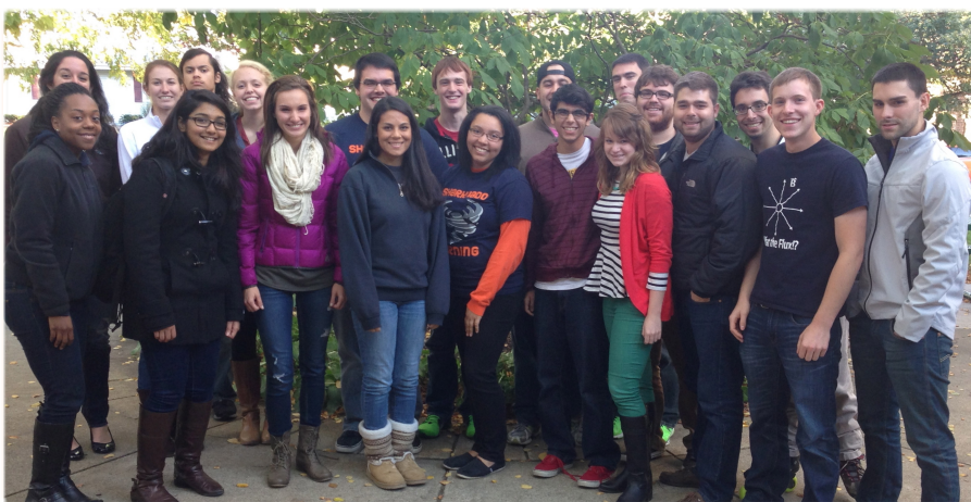
The Student Chapter of the American Meteorological Society at the University of Illinois in Urbana-Champaign

Outside of these research projects, SCAMS@UIUC is also planning to do fundraising activities that include supporting an organization involved in disaster relief and leaf raking for residents in the community. The chapter will also be presenting a weather safety course to the local Boy Scouts troops to help them earn a weather merit badge. Additionally, SCAMS@UIUC will be holding a science night at a local school in order to teach students about Atmospheric Sciences.