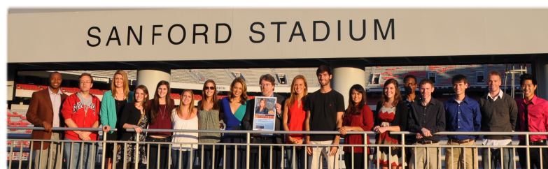
Members of the University of Georgia Student Chapter