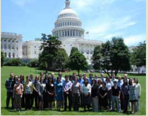
Summer Policy Colloquium participants for 2010 (see p 3).