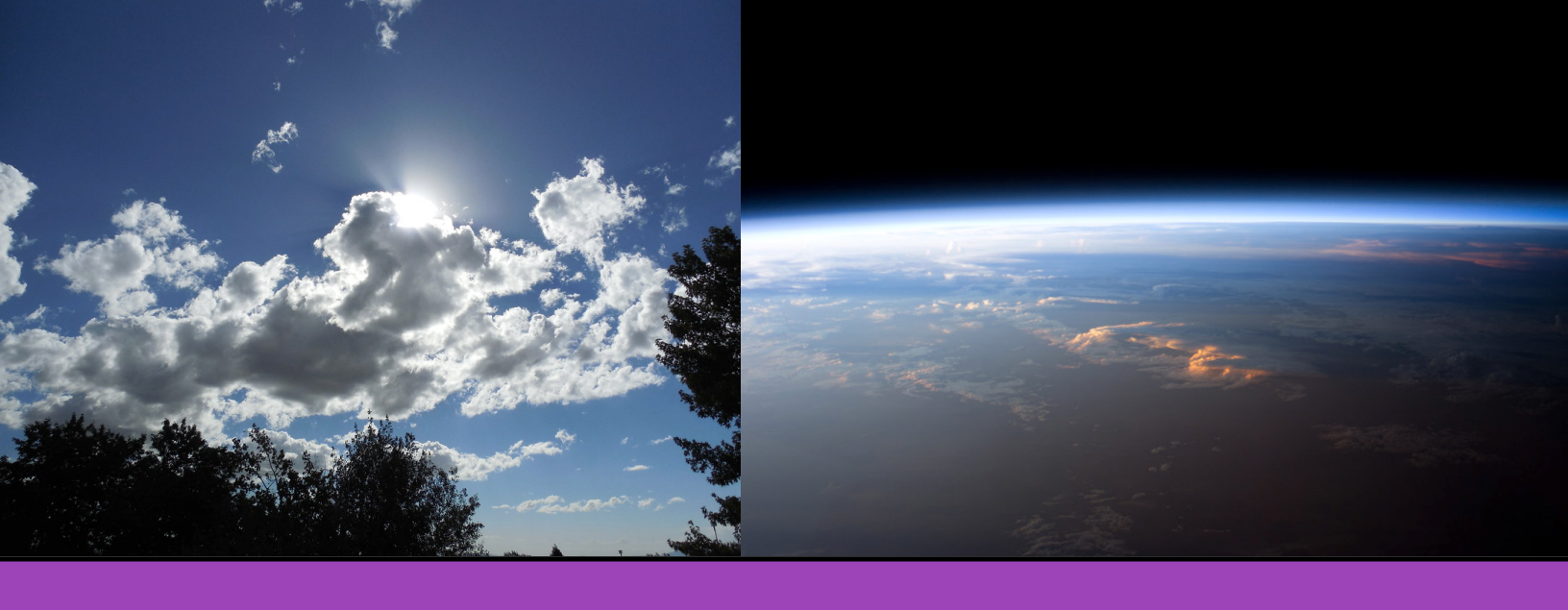
Societal Benefits in Weather, Water, and Climate: Understanding, Communication, and Enhancement