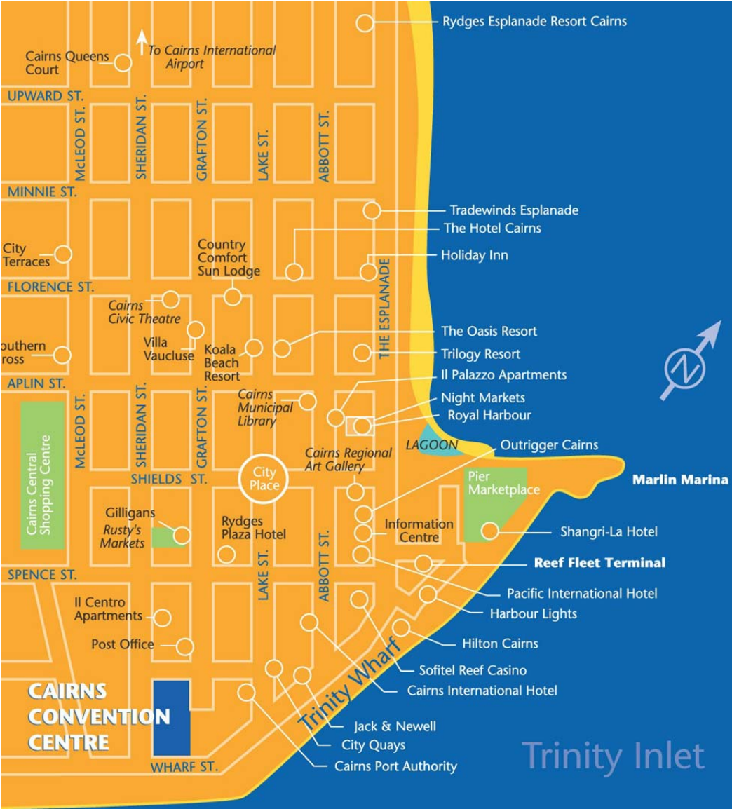
Cairns city map showing the Convention Centre and accommodation locations.

Shuttle buses – Guests staying at other Rydges Hotels ( Tradewinds Esplanade and the Esplanade Resort ) have a longer walk to the Convention Centre (15 minutes and 20 minutes respectively). Rydges are offering access to a complimentary shuttle bus that will transport guests to and from the Convention Centre.