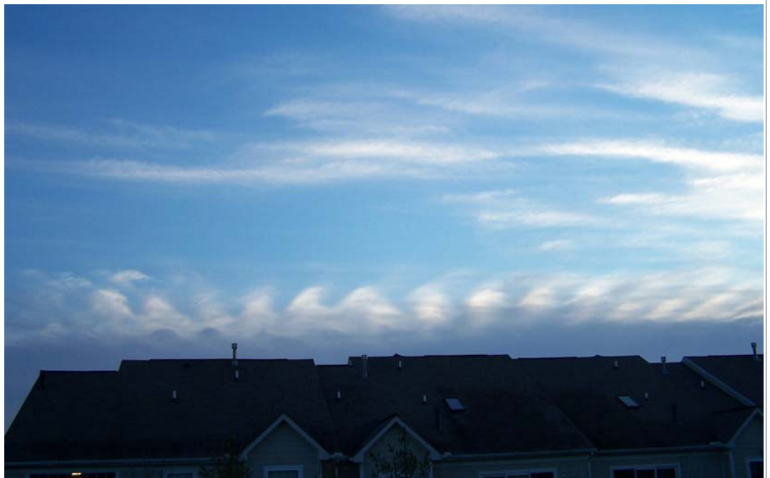
Opposing Kelvin-Helmholtz waves at different levels, 19 December 2006, Beaver creek, OH