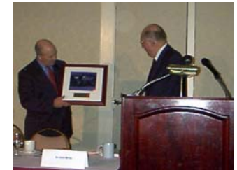
Chief Justice Rehnquist receiving "Weather Weenie" plaque from the DC Chapter.