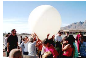
Meteorological instrument demonstration for El Paso and Las Cruces school children at the White Sands Missile Range, New Mexico.